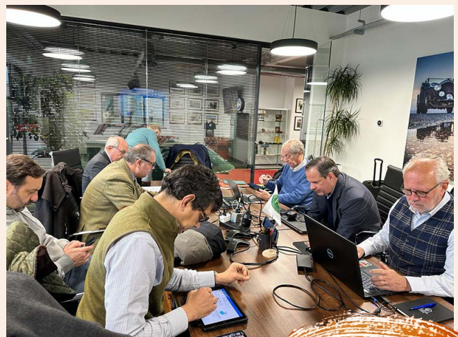
The Technical Commission at work in Bicester (UK).

Thank you for your attention and see you soon.