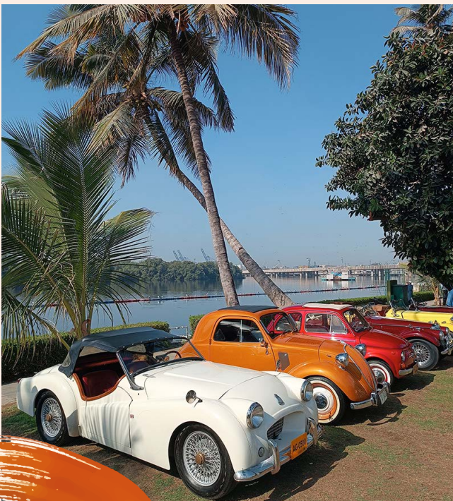
Palm trees and sea at the first concours d'elegance in Karachi, Pakistan.