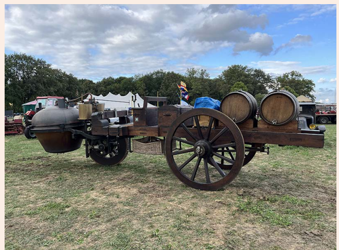
A reproduction of the 1769 Fardier de Cugnot, the first motor vehicle in history.

Central to its strategy is active participation in exhibitions and events. Last year, the Commission made significant contributions at Retro Classics in Germany, ASI Transportshow in Italy, and the International Historic Festival in the Netherlands. These engagements not only showcased a diverse range of utilitarian vehicles but also facilitated meaningful exchanges of information, attracting attendees of all ages.