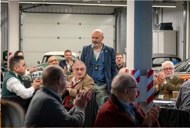
A moment of the successful FIVA Stewards Seminar in Bicester (UK).

Restoration projects often involve cross-border activities and trade, potentially conflicting with efforts to prevent exporting waste cars to non-EU countries. However, these concerns seem to be considered, and we hope they'll be satisfactorily addressed.